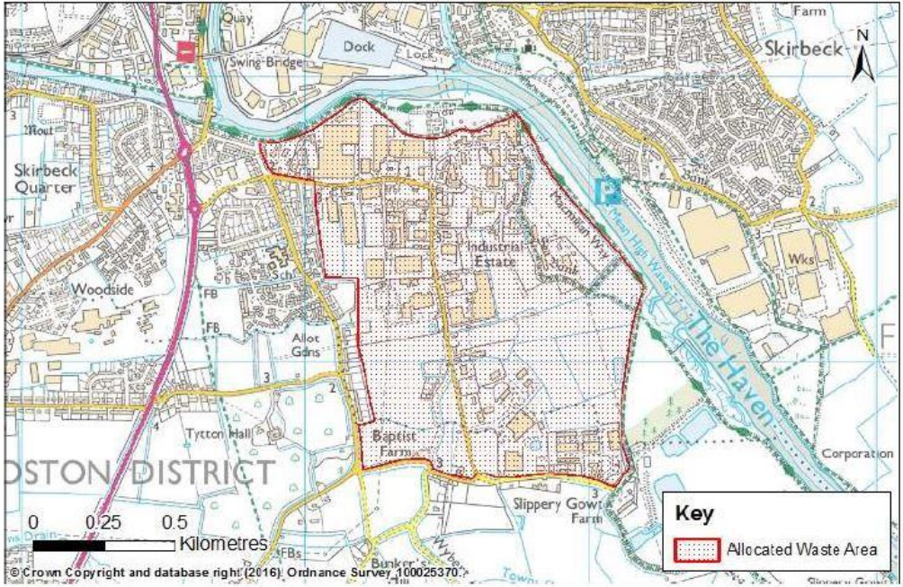
Plate 4-1 Riverside Industrial Estate Land Allocation.